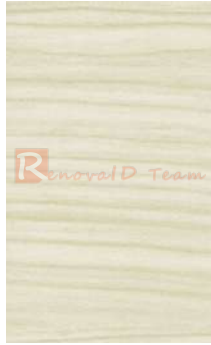
90T71 R Cherry