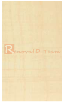
90T33 HL Crossfire