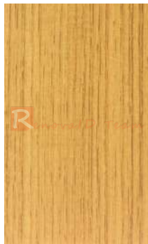
90T23 L Oak