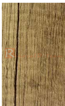
80T55 Raw Wood