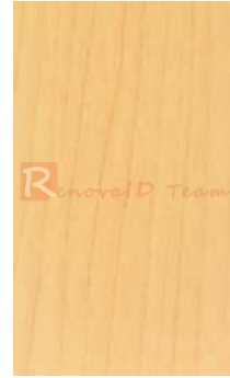
80T13 B Maple