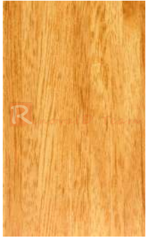
90T45 T Plank

#There will be variations in actual product due to screen resolution. * Sample shown is a small piece cut out of 3ft x 7ft full size laminate.