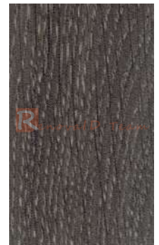
90T73 Milan Oak