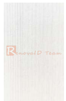
80T71 White Oak