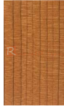
90M52 Memphis Teak