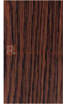
80T80 M Wood