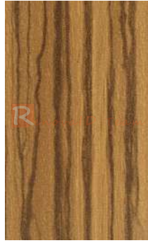
80T97 L Zebra