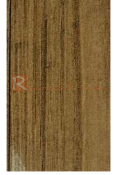
80T32 Rustic Plank