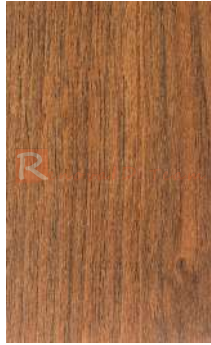
80T86 Summer Walnut