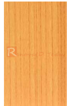
90T22 N Elm