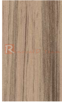
80T70 Z Wood