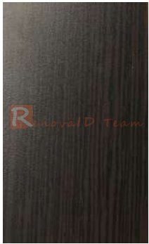
80T89 C Wood