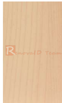
90T21 P Cherry