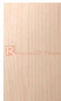
90T20 S Cherry