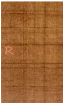
90T31 HD Crossfire