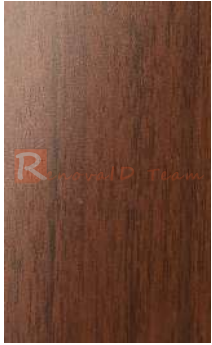
80T30 A Walnut

#There will be variations in actual product due to screen resolution. * Sample shown is a small piece cut out of 3ft x 7ft full size laminate.