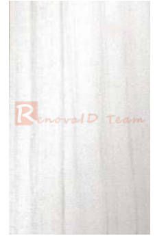
90T16 H Elm