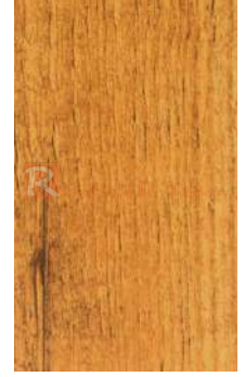
80T29 Golden Oak