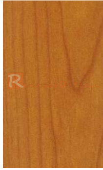
90T33 HL Crossfire