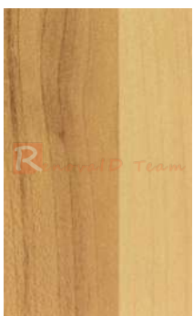
90T93 Supreme Maple