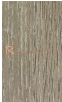
90T72 Vienna Oak