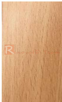
90T28 M Beech