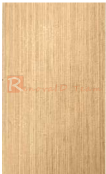
90T66 Yohan Wood