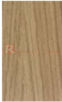
90T29 E Cherry