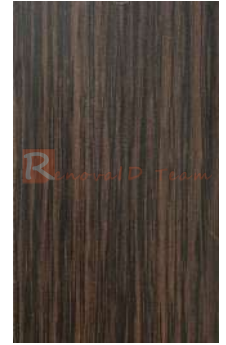
80T81 G Wood