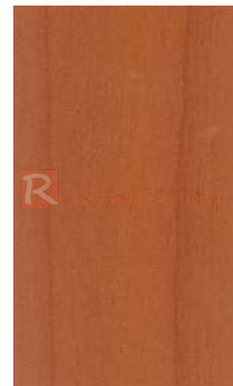
90T51 A Cherry