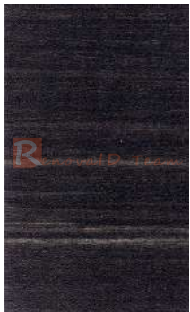
90T19 Revwood YK