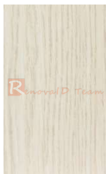
90T71 Winter Oak