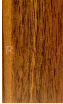
90T56 Noble Walnut