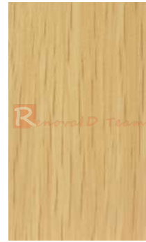
90T24 Vok Beech